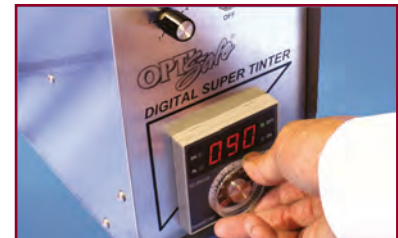
Accurate digital temperature control