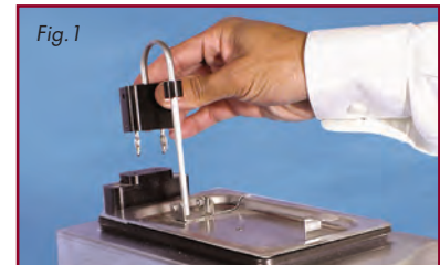
Fig. 1 Detachable temperature probe.

OptiSafe Digital Tinter 1NS is a single quart (946ml) tank heating system combining accurate digital temperature control, split lid, and nonstick tank (Vat) for heating lens tinting solutions. The detachable temperature probe (Fig.1) is immersed into the tint solution to reflect solution temperature, not the temperature of the HTF as in conventional heating systems. The unit requires only 15 fl. oz. (444 ml) of HTF. The HTF is a water soluble, environmentally safe, nonhazardous, biodegradable oil blend. Multiple units can be aligned side by side to create a tinting system that is perfect for your needs.