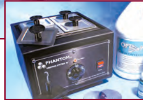
4 mini tanks option